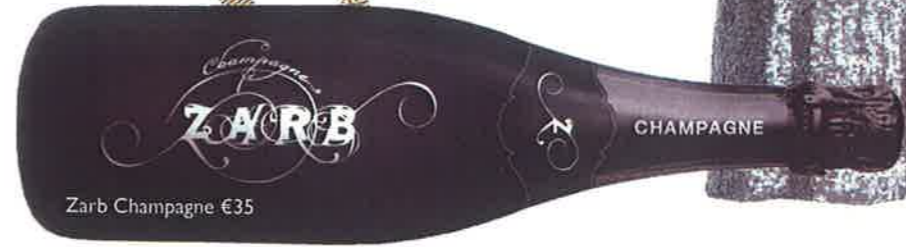
Zarb Champagne €35