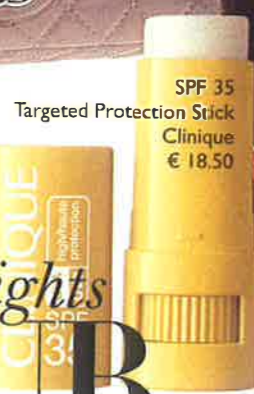
SPF 35 Targeted Protection Stick Clinique € 18.50