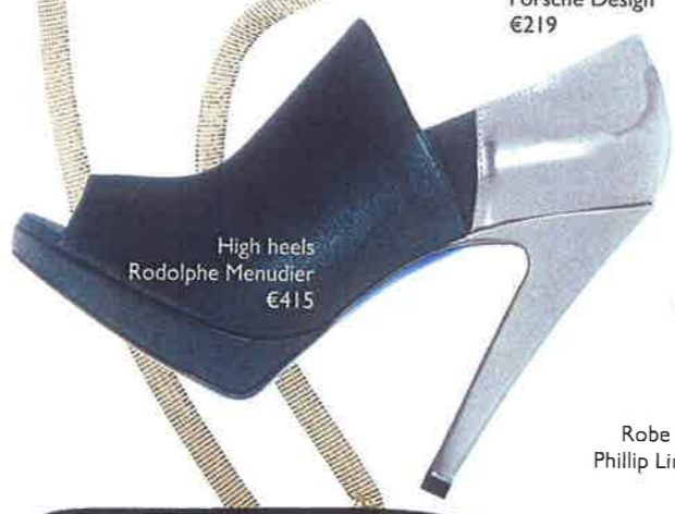
High heels Rodolphe Menuudier €415