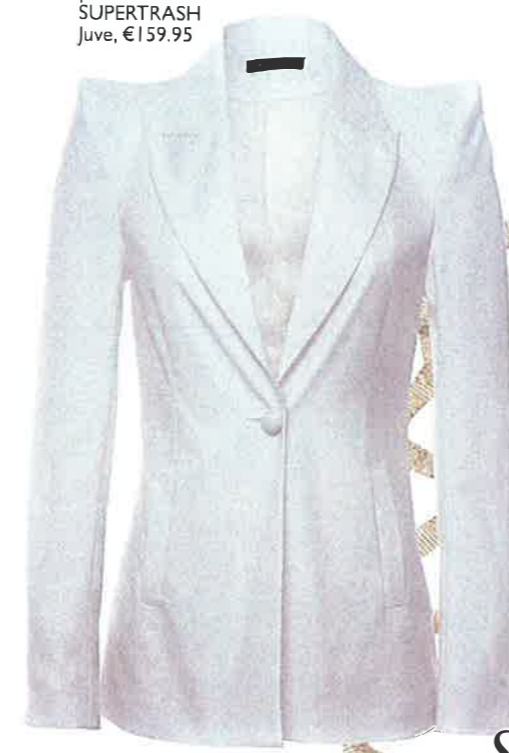
Off white blazer with padded shoulders SUPERTRASH Juve, €159.95