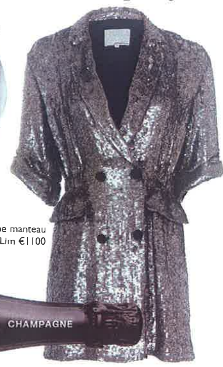
Robe manteau Phillip Lim €1100